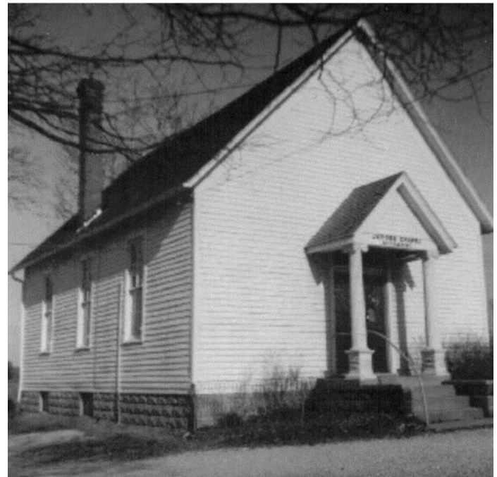
JACOBS CHAPEL CHURCH